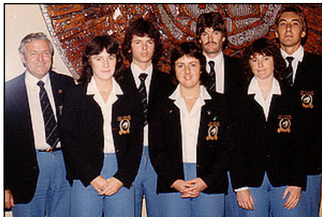
NZ team to World Championships, Yugoslavia - 1981