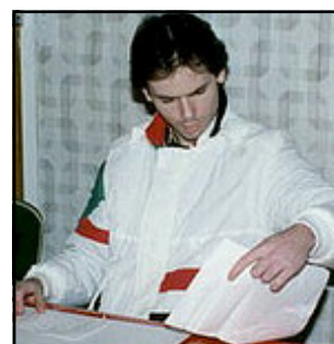
1993 - working at NZ Open