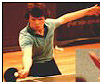
1983 NZ Open