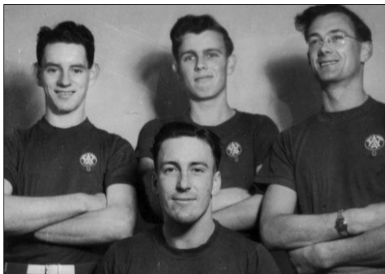
Auckland Men's team 1950 Winners Kean Shield NZ Champs