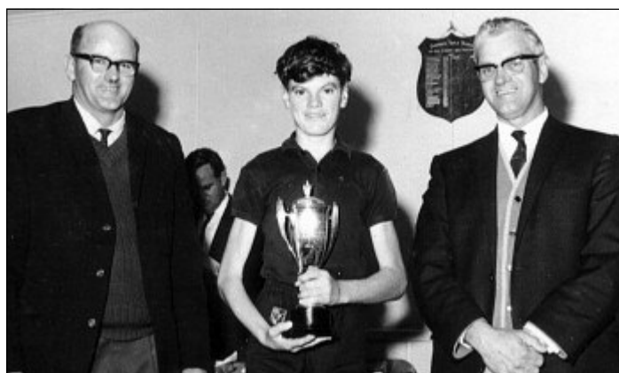
Presentation Flint & Ward Memorial Trophy National Coaching School 1969